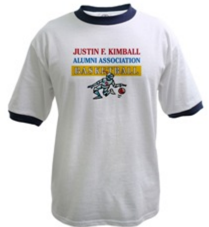
Basketball Ringer T