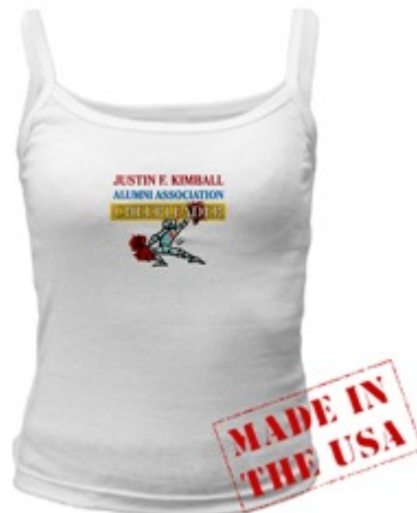
Cheerleader Jr. Spaghetti Strap